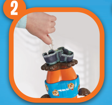
Turn the Fox upside and pull on the string to release his trousers.