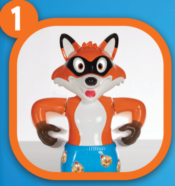
Move the Fox's arms upwards.